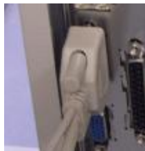
Can Be 9 Pin or 25 Pin Connector