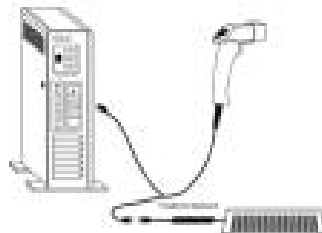
Dataman Barcode Systems